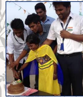
Staff Birthday celebration