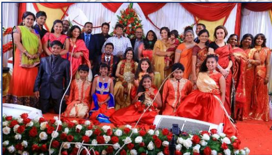
Wedding in Kanyakumar with family

HOSPITAL NEWS: We were busy as usual in our regular hospital works and eye camps. We also pursued to get BSc Optometry affiliation with Rajiv Gandhi University of health sciences, Bangalore. We are now happy to introduce this course in 2015. We celebrated Independence Day on 15th Aug along with family, staff and children.