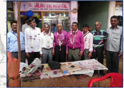
Mannaekheli vision centre opening ceremony