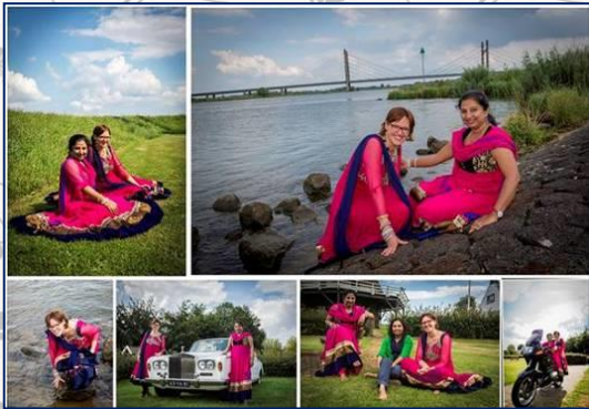
Holland & Belgium trip