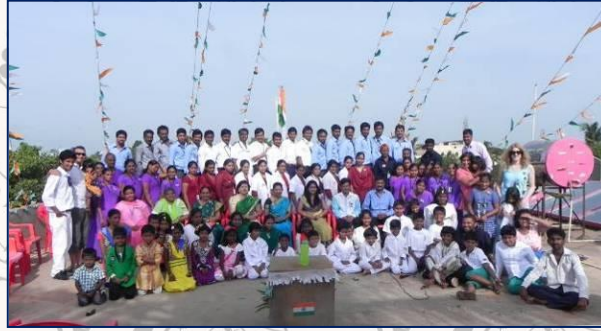
Family, staff and children on Independence Day

HOSPITAL NEWS: We were busy as usual in our regular hospital works and eye camps. We also pursued to get BSc Optometry affiliation with Rajiv Gandhi University of health sciences, Bangalore. We are now happy to introduce this course in 2015. We celebrated Independence Day on 15th Aug along with family, staff and children.