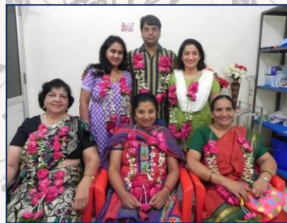
AGM meeting Aug 2014

We shifted our Vision entre to Mannaekheli from Gumpa in Aug'14.