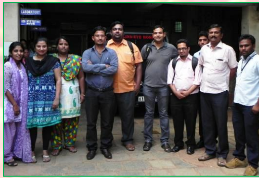
CBM & CPA Visitors