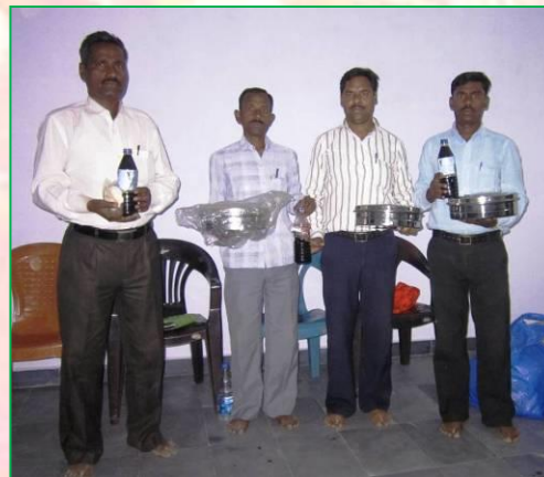
Communion sets distribution to all Velemegna Pastors